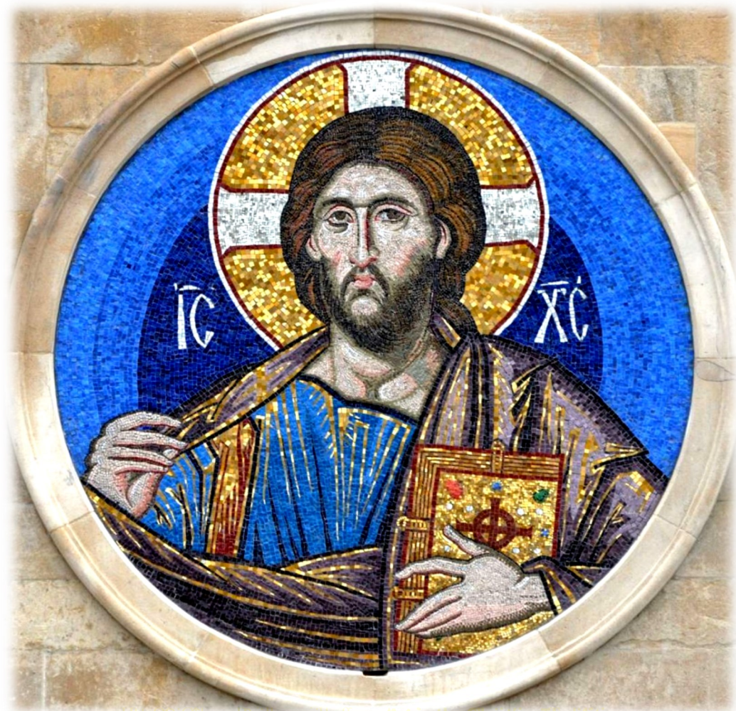
Christ the Pantocrator of Roath (Aidan Hart, 2013)

THE LAST SUNDAY AFTER PENTECOST: CHRIST THE KING