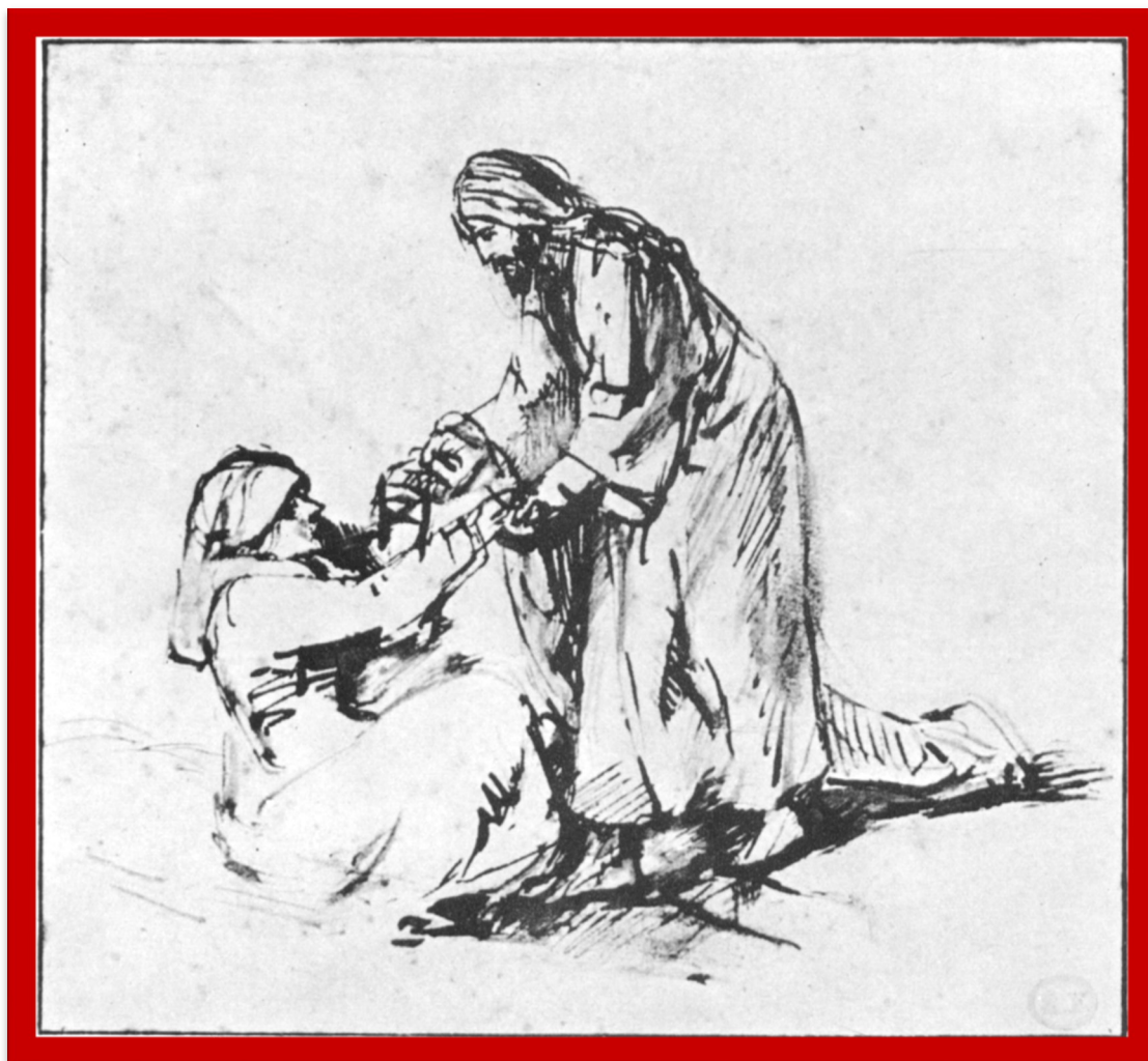
Christ Healing Peter's Mother-in-Law - Rembrandt Harmenszoon van Rijn, 1606-1669