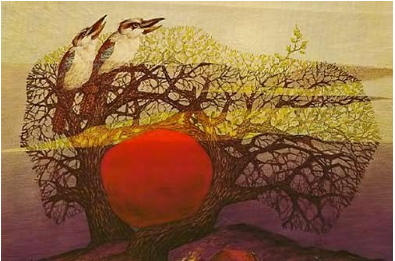
"Rainmakers At Dawn" by Ainslie Roberts

ANNOUNCEMENTS APRIL 29 TH 2018 FIFTH SUNDAY IN EASTER