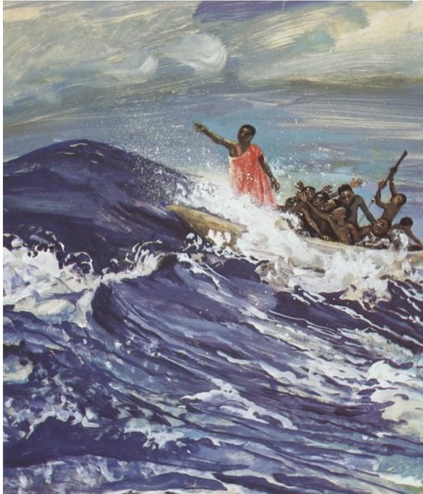
“Jesus lulls the storm” -Jesus Mafa