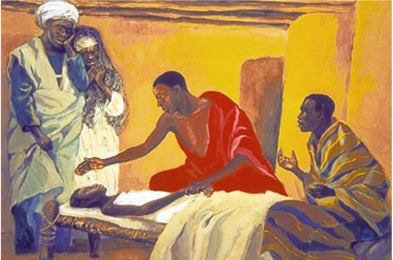
Healing of the Daughter of Jairus by JESUS MAFA

JULY 1ST, 2018 SIXTH SUNDAY AFTER PENTECOST