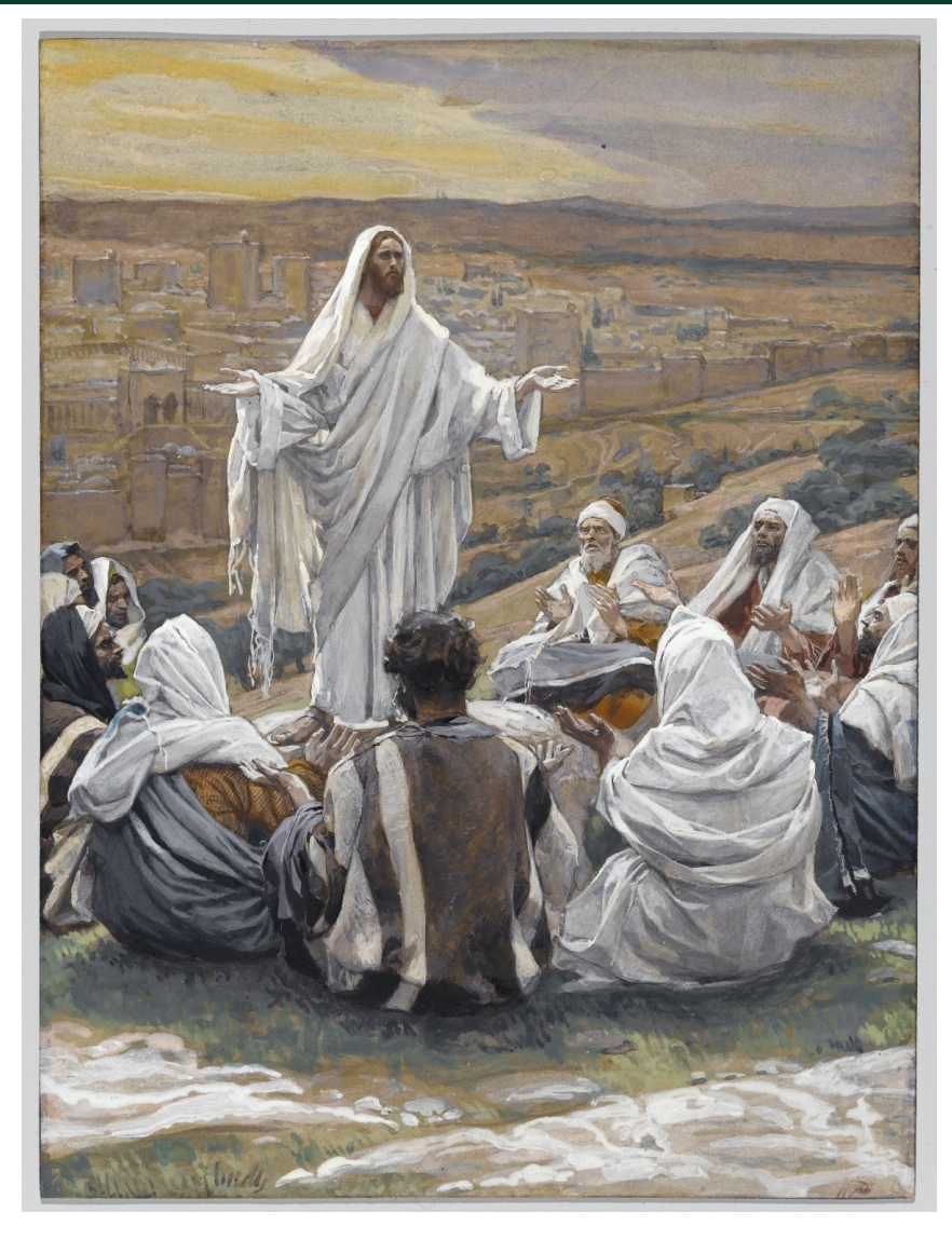
"The Lord's Prayer" by James Tissot