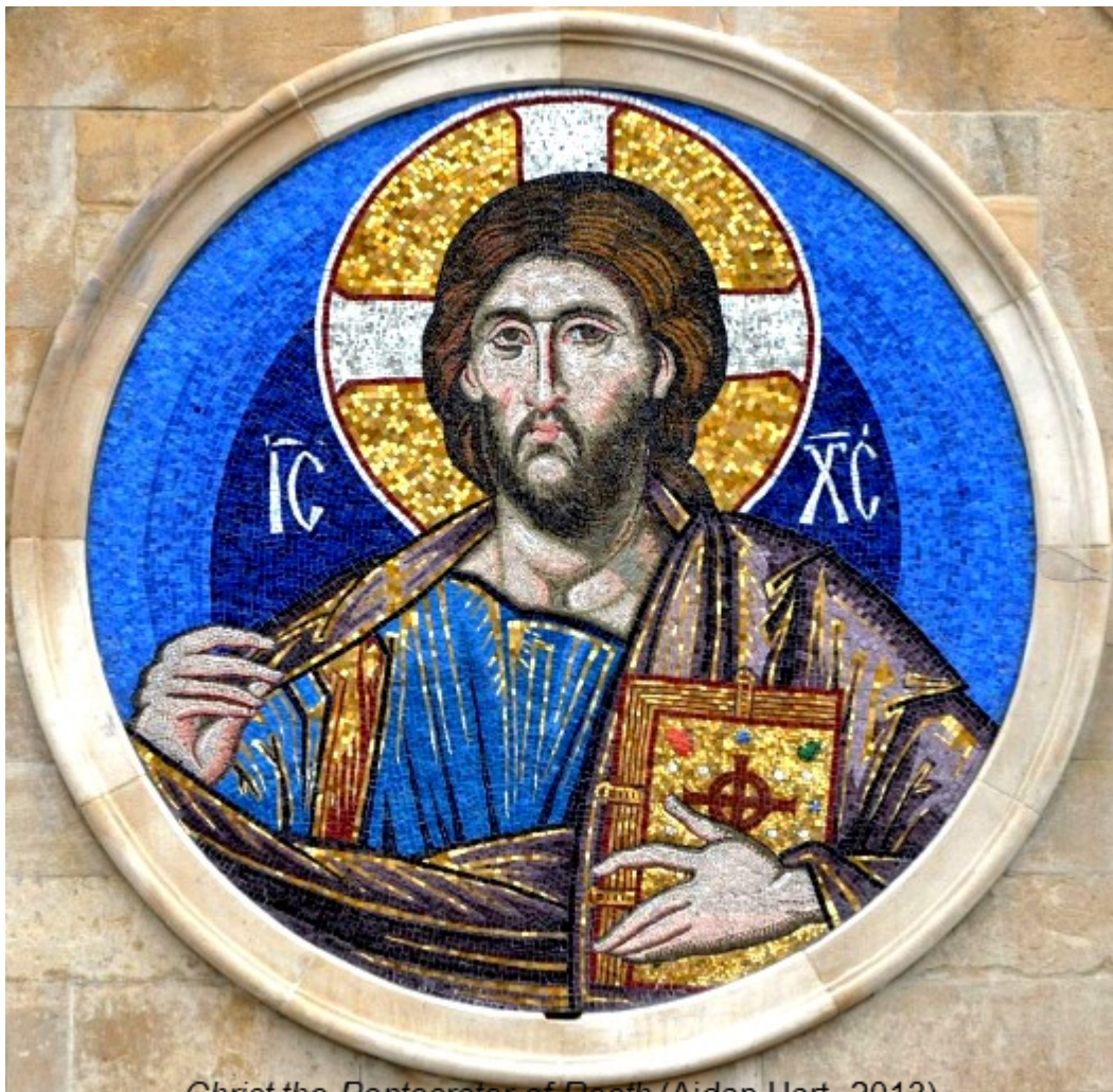
Christ the Pantocrator of Roath (Aidan Hart, 2013)